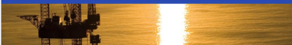
Pehakura Development (Enxco Rig 56), Offshore Taranaki